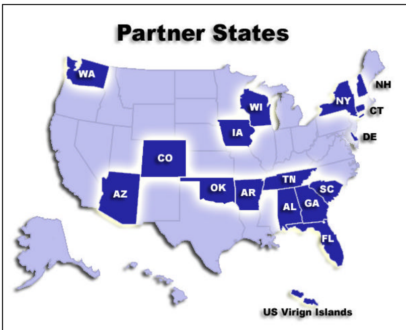
Figure 3: TraCS Partner States

One program of particular interest in the development of electronic citation technology is Traffic and Criminal Software (TraCS). Iowa has partnered with the Federal Highway Administration to develop the TraCS crash reporting system. Out of this